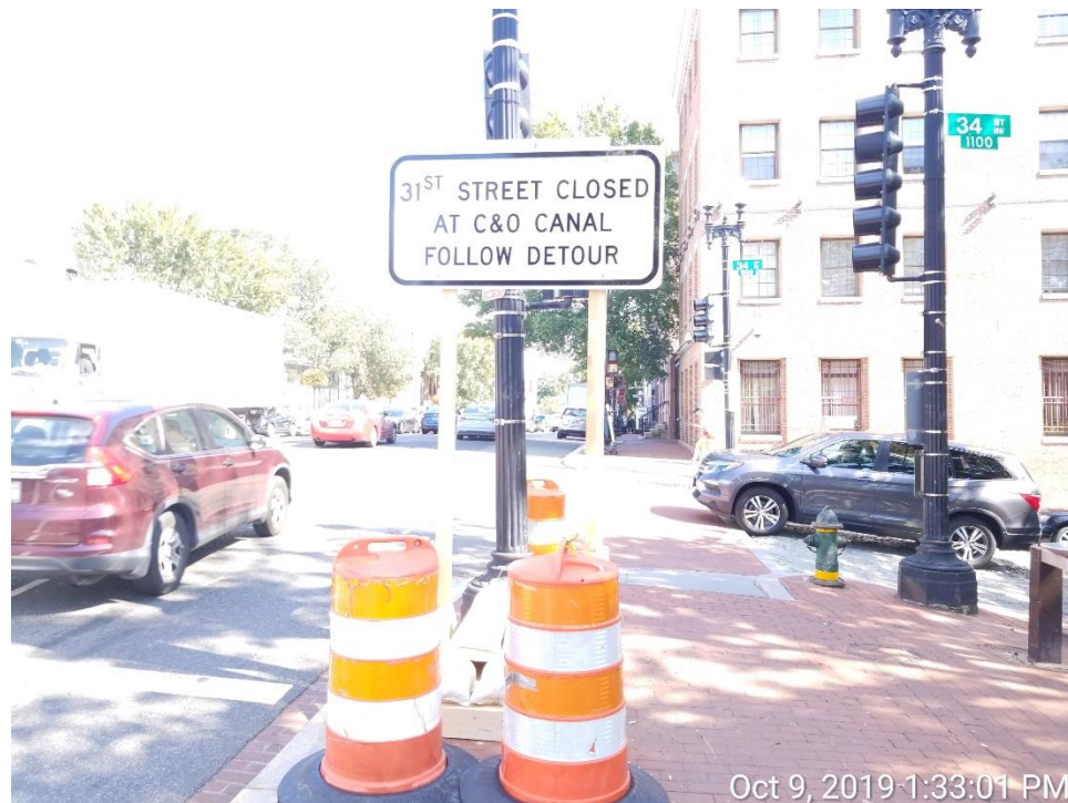
Replacement of VMS with Static Sign – EB M Street