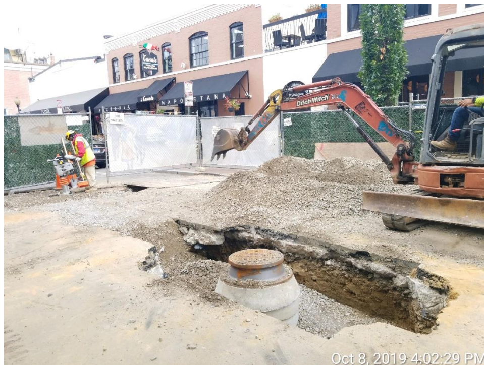
Backfilling Water Main Trench – North Side of the Bridge