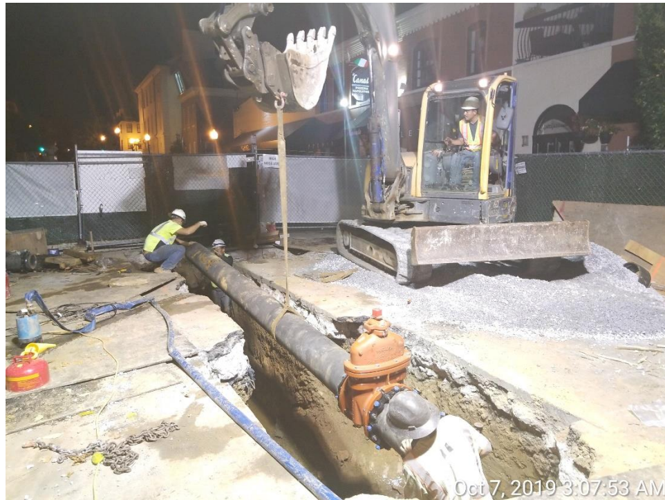
DC Water Shut Down for Water Main Tie-in