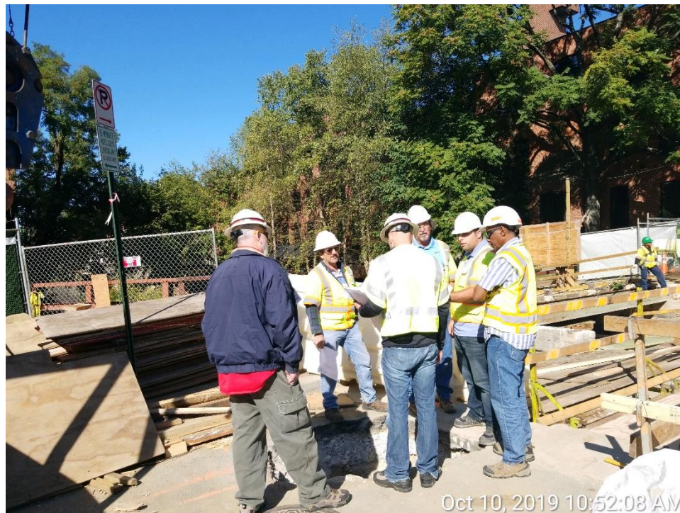
Utility Relocation – Field Meeting with Verizon