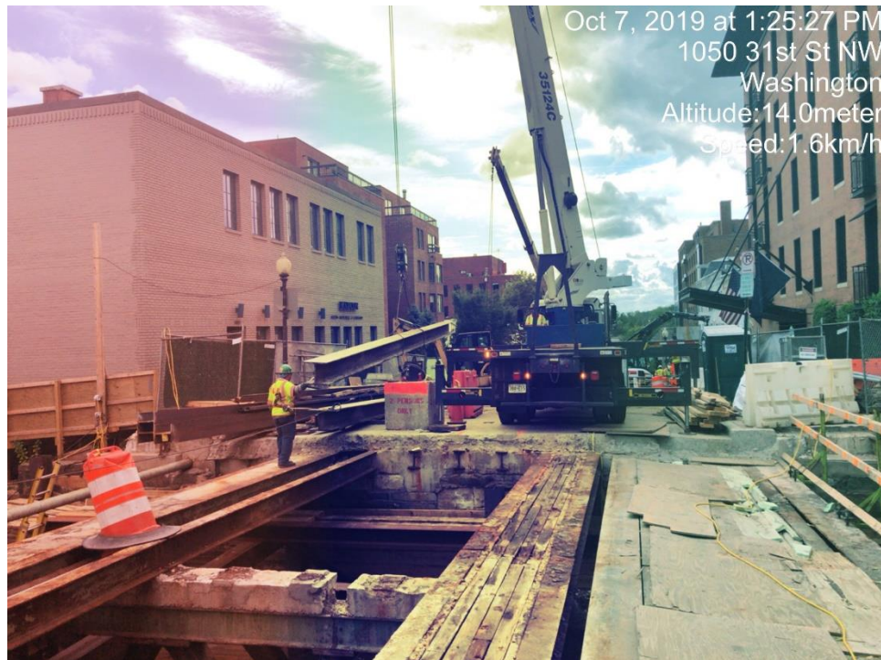
Demolition of Existing Bridge Superstructure