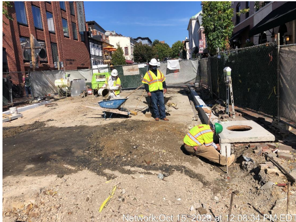
Replacement of Storm Drain Inlet Cover – NE Side of the Bridge