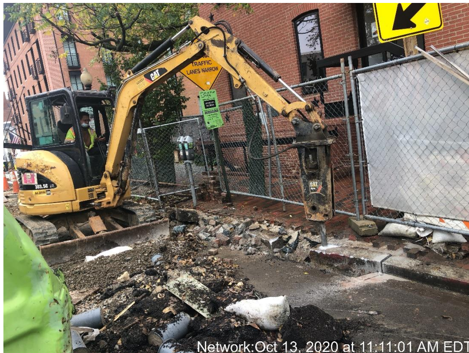
Network: Oct 13, 2020 at 11:11:01 AM EDT Demolition of the Existing Granite Curb – NW Corner