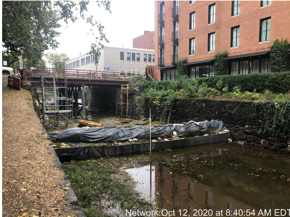
Network: Oct 12, 2020 at 8:40:54 AM EDT Upstream Section of the Canal