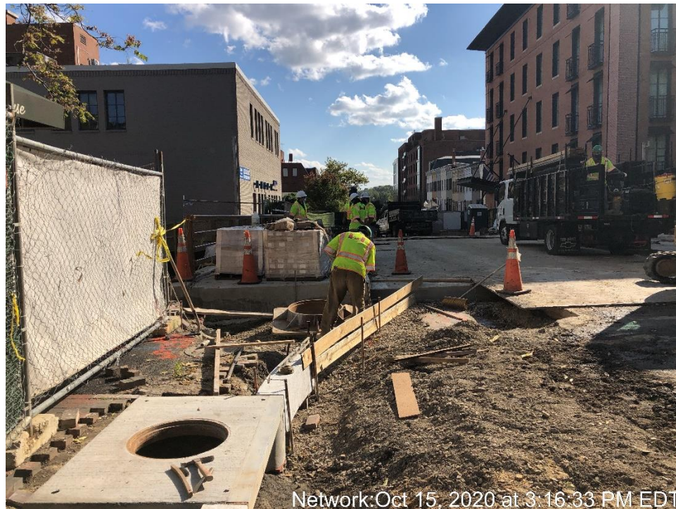
Installation of Formwork for the Sidewalk – NE Corner