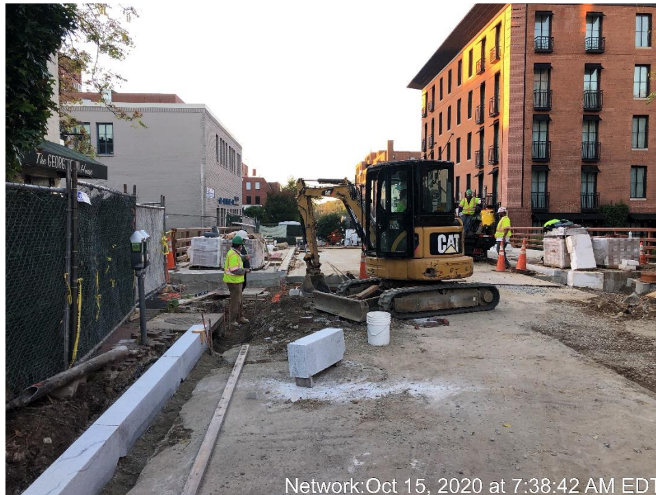
Installation of Granite Curb at SW Side of the Bridge