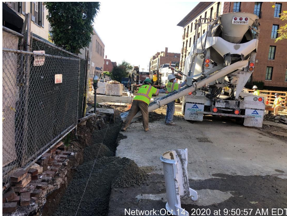
Installation of Blow Off Valve for the 12-Inch Water line