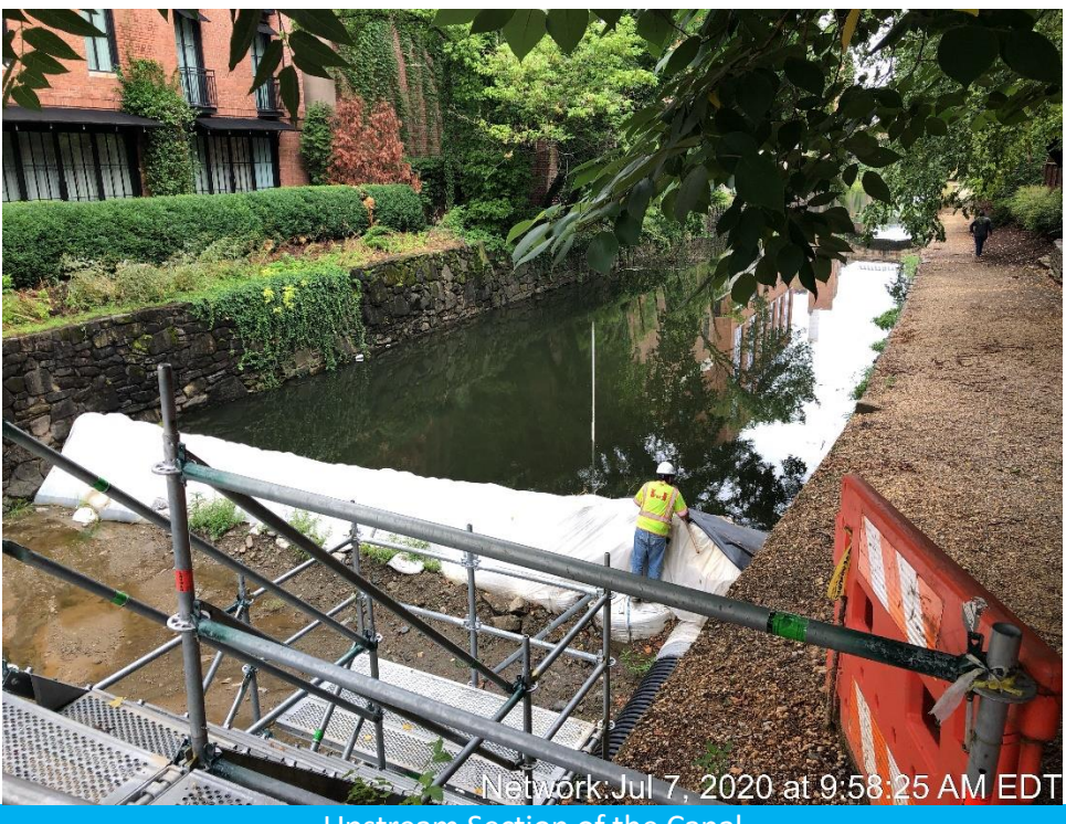
Upstream Section of the Canal