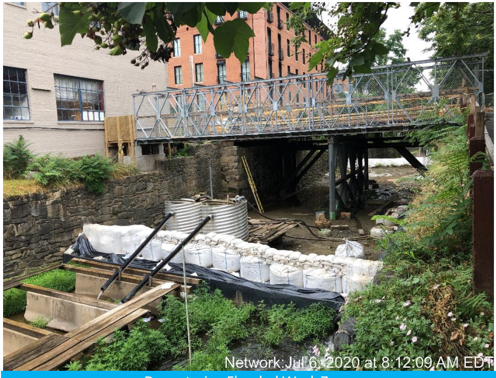
De-watering Flooded Work Zone