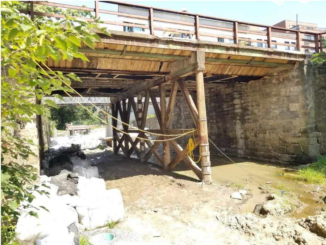
31 ST Street Bridge over C&O Canal