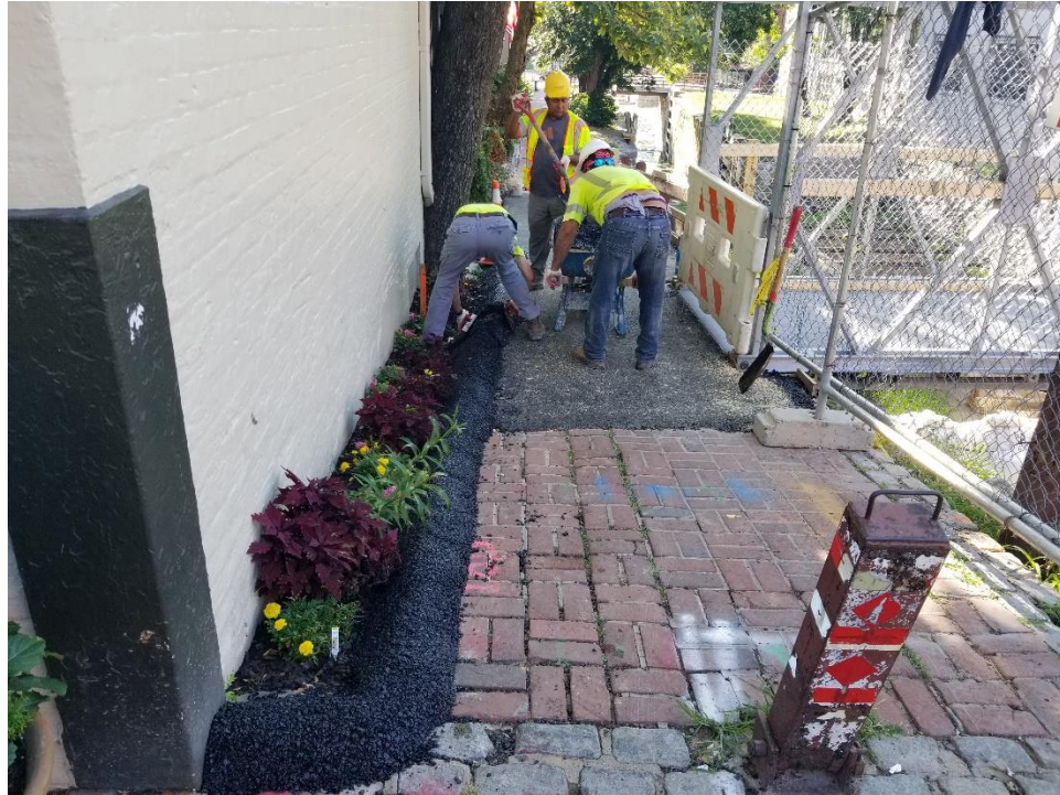
Installation of Asphalt Curb Along Georgetown House