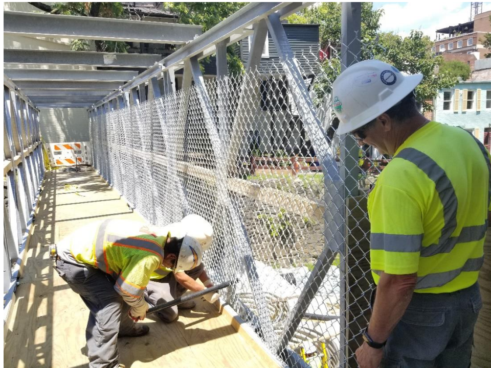
Installation of Steel Chain Link Fence on the Pedestrian Bridge