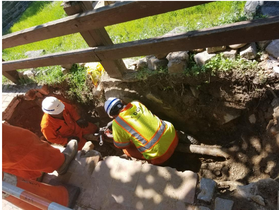
Washington Gas Cut/Tap Work s