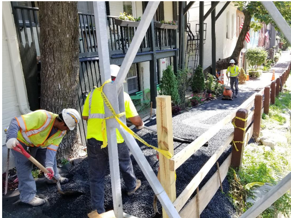
Installation of Asphalt Accessway on North Side of Pedestrian Bridge