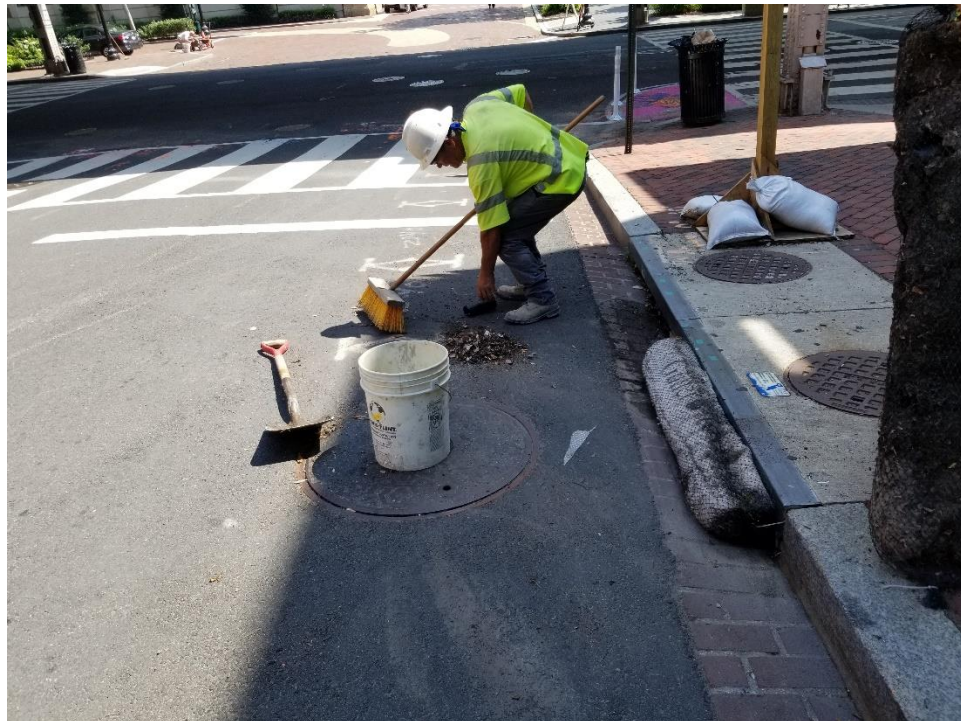
Cleaning DC Water Inlet Protection