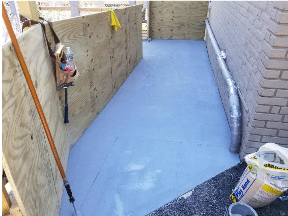
Application of Anti-Skid Paint on the Pedestrian Bridge Walkway Decking