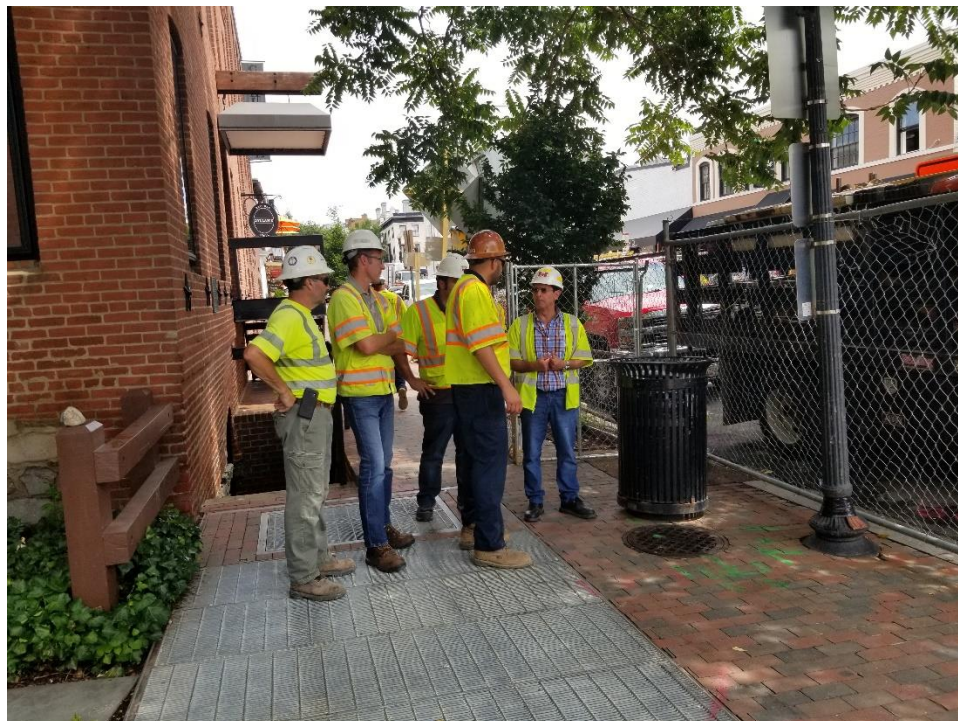
Field Meeting with Micropyle Contractor (CCGI)