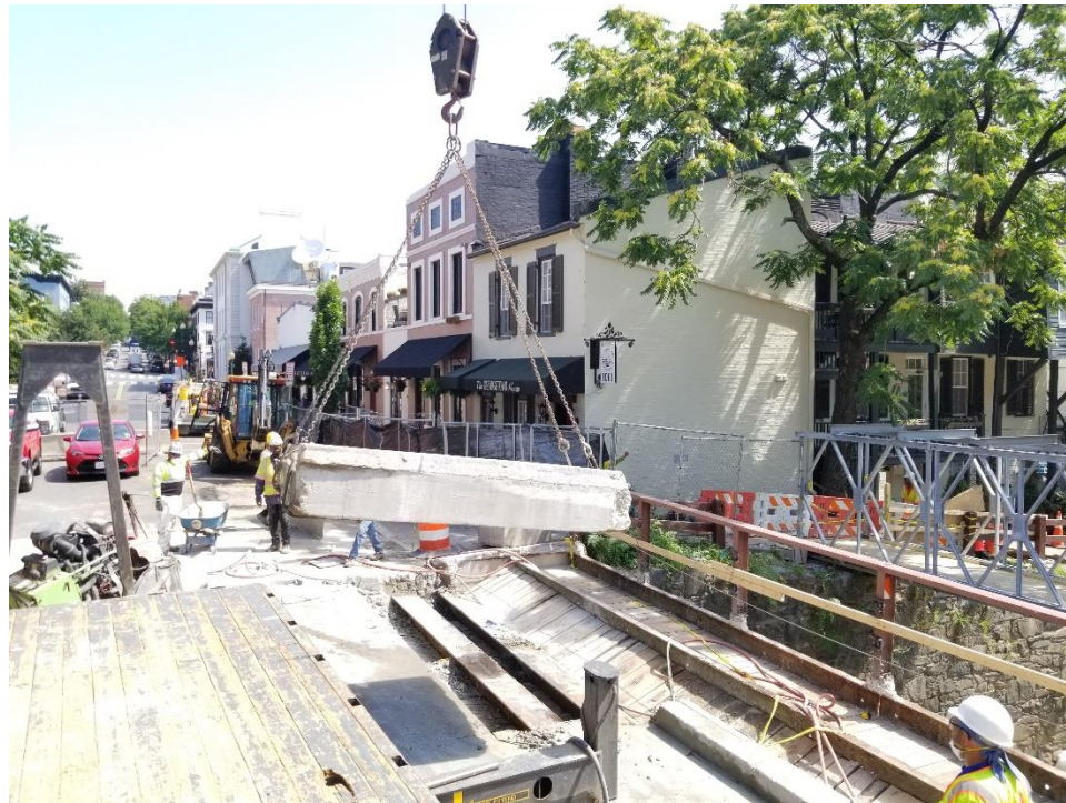
Demolition of the Existing Bridge Deck