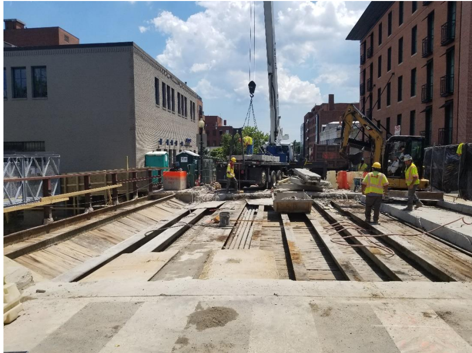
Demolition of the Existing Bridge Deck