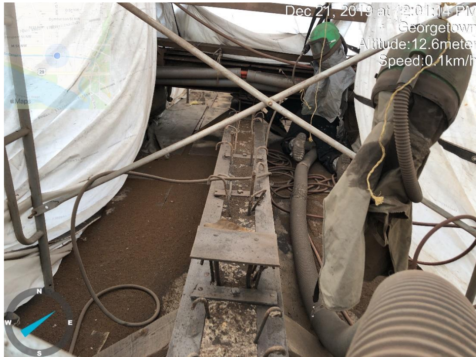
Cleaning the Beam on Top of Historic Piers