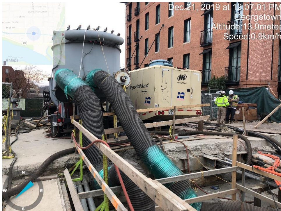
Ventilation for Cleaning and Priming of Piers