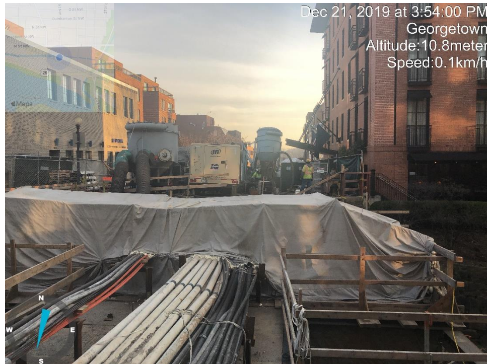
Containment Around Historic Piers