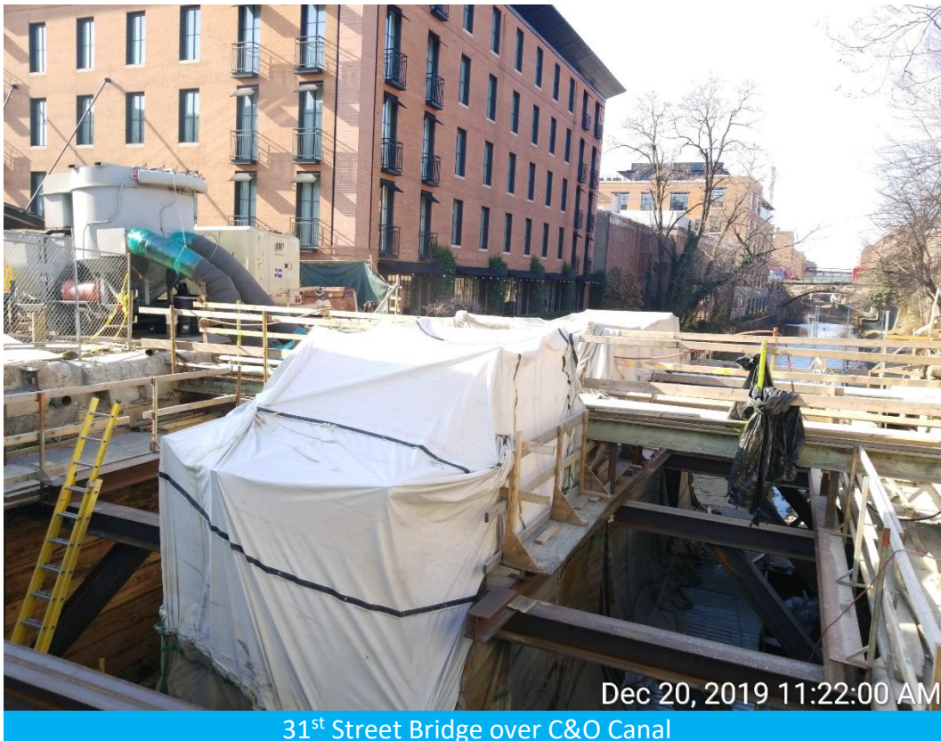
31 st Street Bridge over C&O Canal

Project Website: www.31stStreetBridge.com