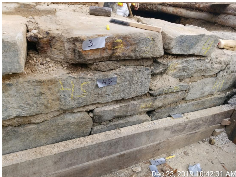
Marking, Cataloguing, and Removal of Canal Wall Stones