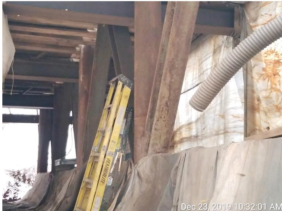
Pier Cleaning and Priming