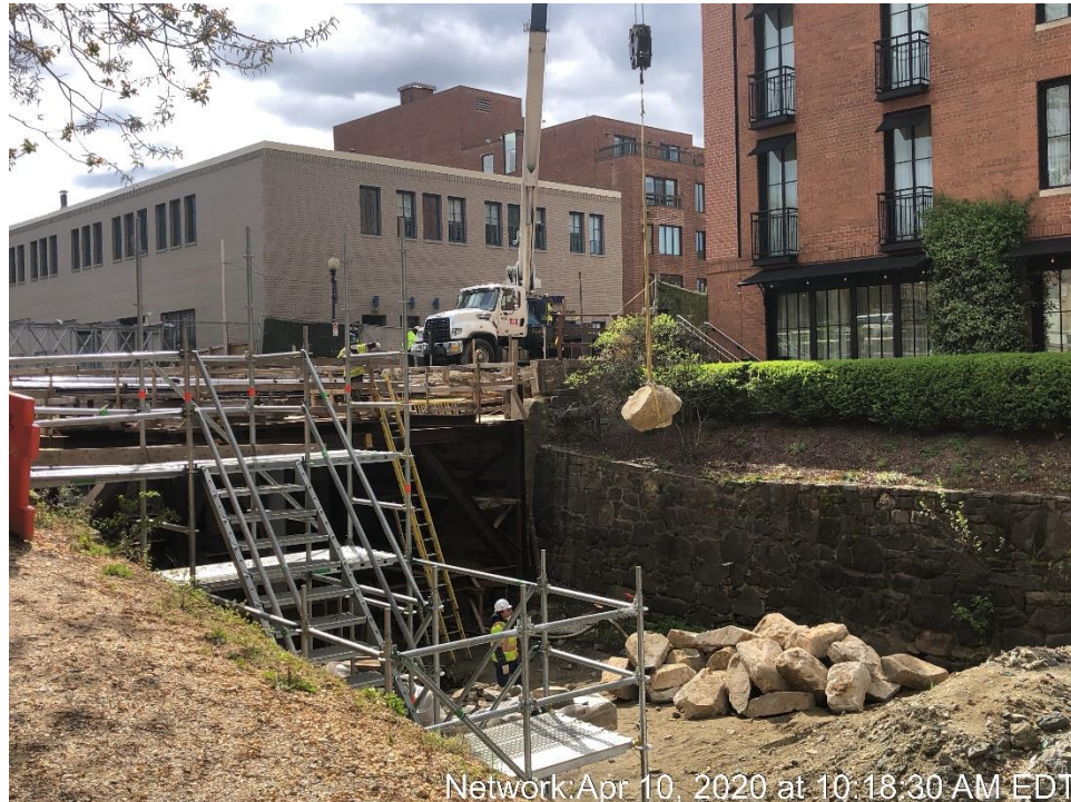
Network: Apr 10, 2020 at 10:18:30 AM EDT Lowering the Removed Wall Stone into the Canal