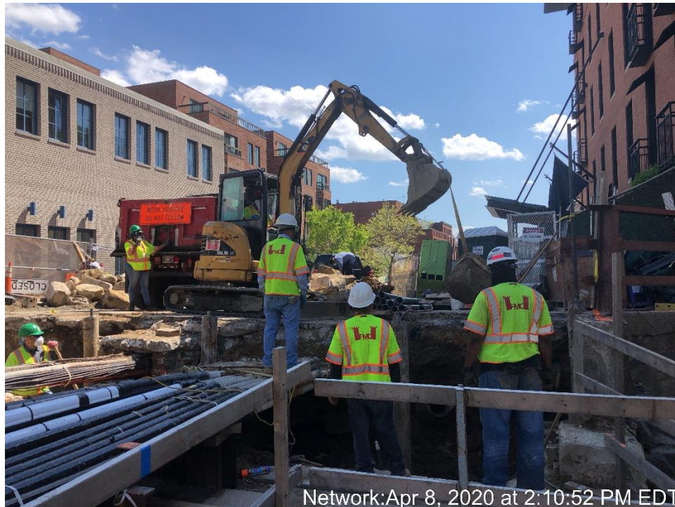
Back Wall Excavation and Stone Wall Removal at South Abutment