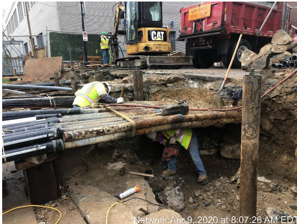
Back Wall Excavation and Stone Wall Removal at South Abutment