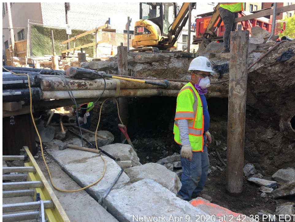
Back Wall Excavation and Stone Wall Removal at South Abutment