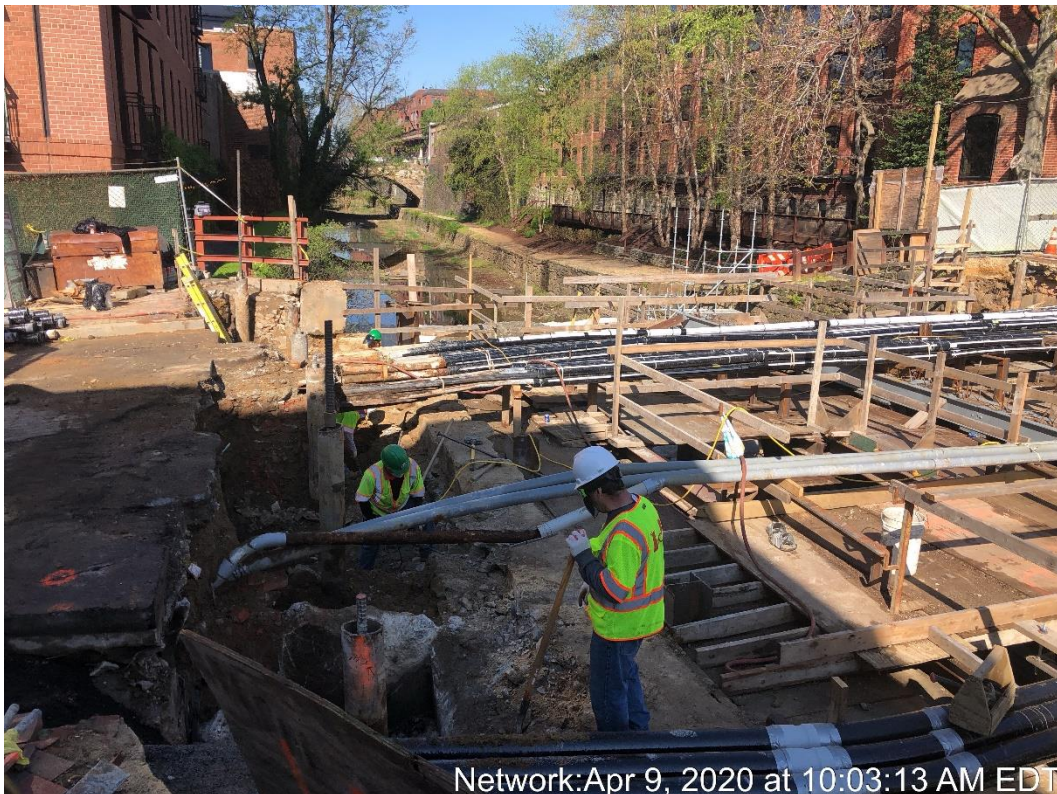
31 st Street Bridge over C&O Canal