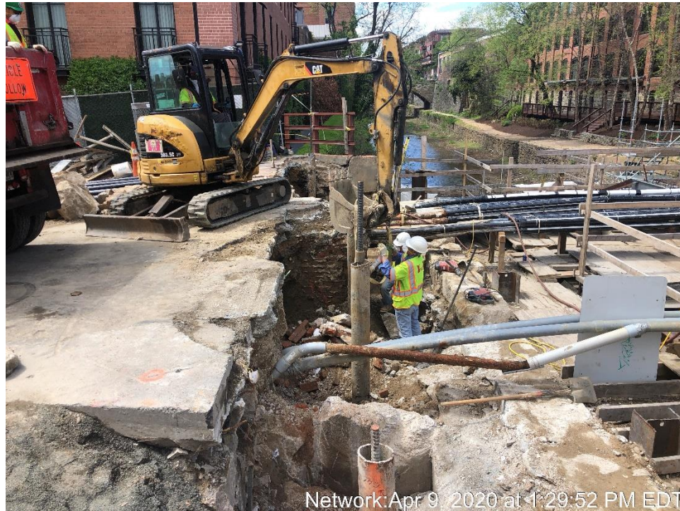
Back Wall Excavation and Stone Wall Removal at South Abutment