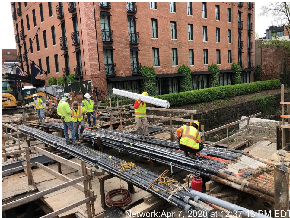
Installation of Split-Duct on Verizon Conduits (by Verizon)