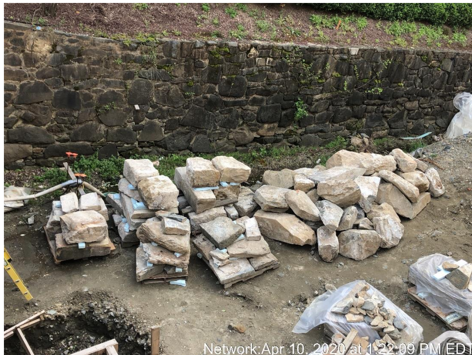
Network: Apr 10, 2020 at 1:22:09 PM EDT Canal Wall Stones Stored in Canal