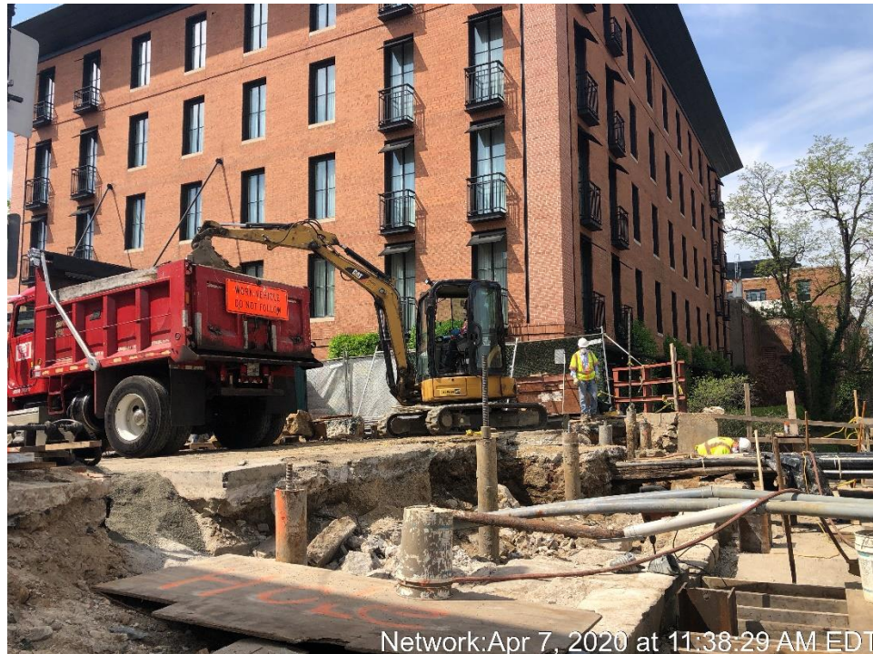
Back Wall Excavation and Stone Wall Removal at South Abutment