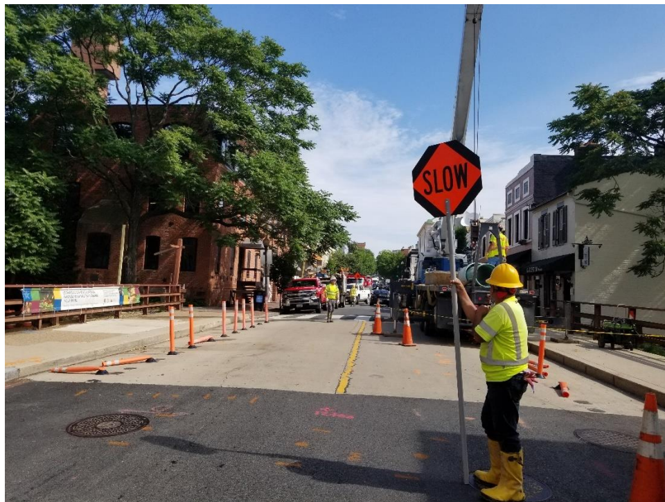
Flagging Operation on 31 st Bridge