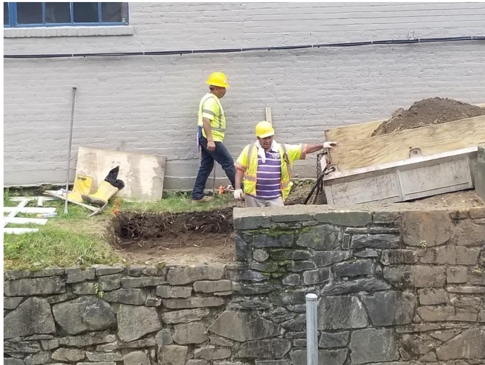
Construction of Temporary Pedestrian Bridge South Footing