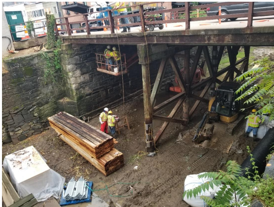
Construction of the Protection Shield Under the Bridge