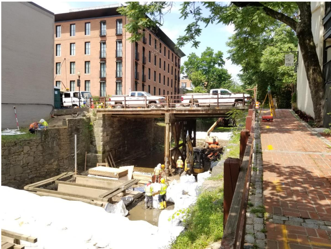
31 st Street Bridge over C&O Canal