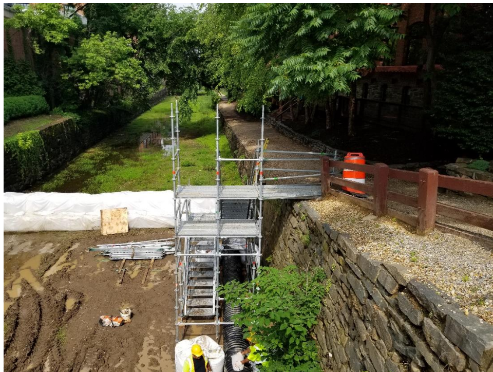
Installation of the Scaffolding Ladder West of the Bridge