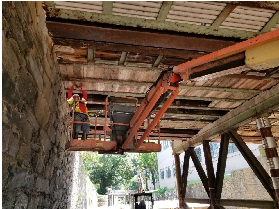
Construction of the Protection Shield Under the Bridge