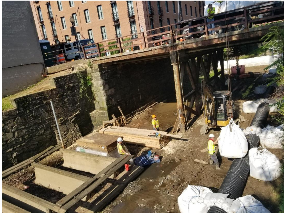
Placing Sand Bags at the Pipe Joints