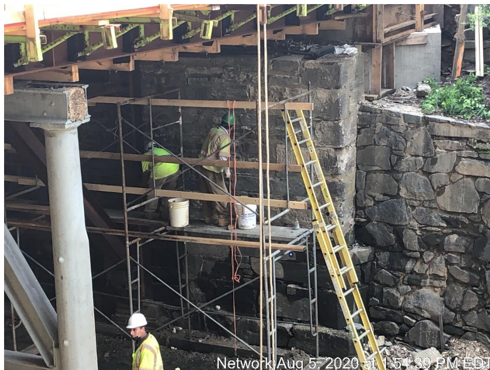
Repointing Work at the South Canal Wall