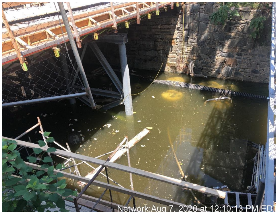
Network: Aug 7, 2020 at 12:10:13 PM EDT Flooded Work Zone