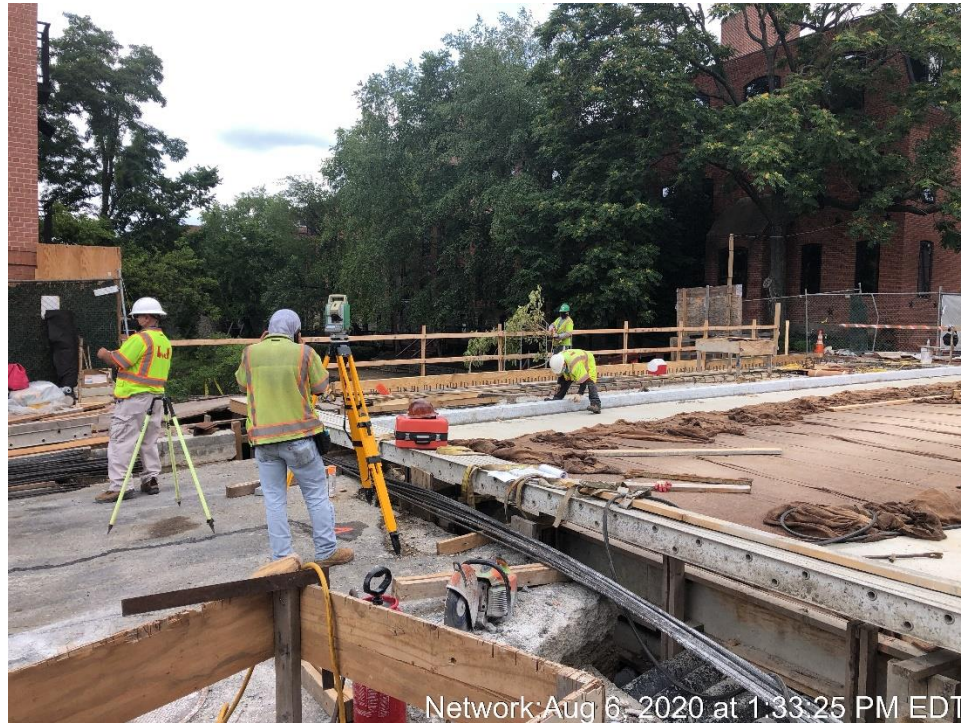
Network: Aug 6, 2020 at 1:33:25 PM EDT Installation of Granite Curb on the Bridge Deck