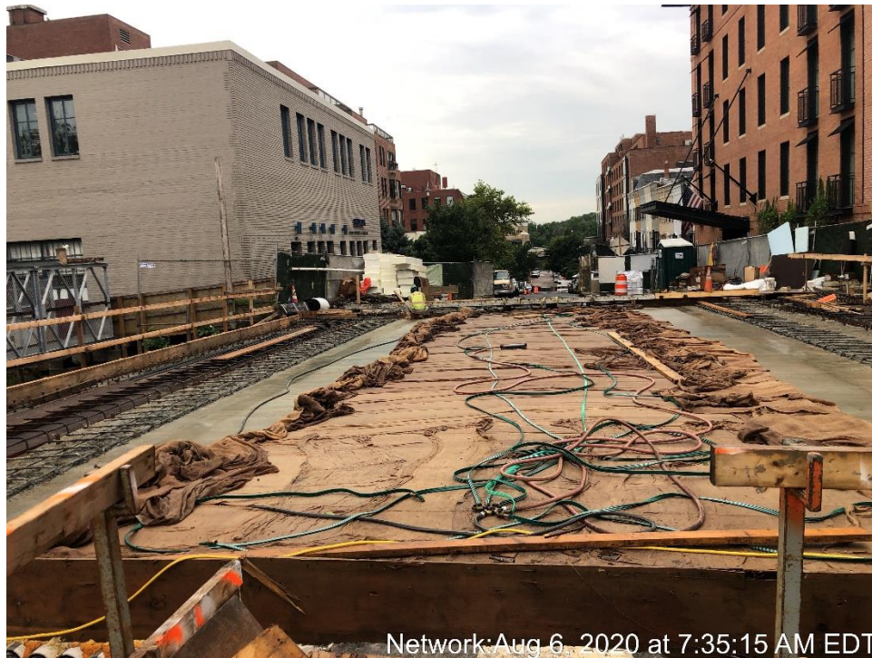
Bridge Deck – Concrete Curing