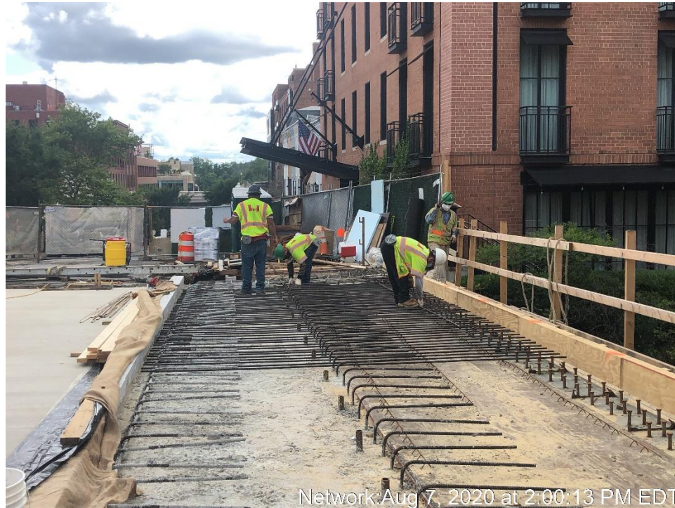
Placement of Reinforcing Steel for Sidewalk on Top of Bridge Deck