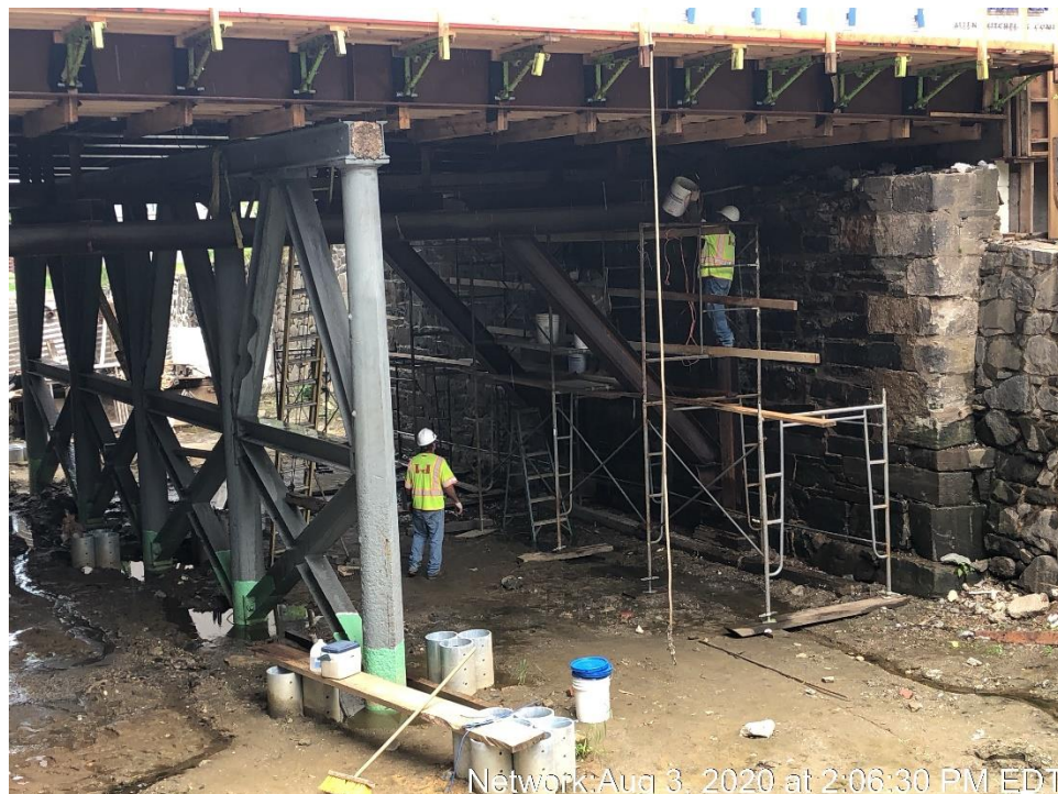
Bridge Deck – Concrete Curing