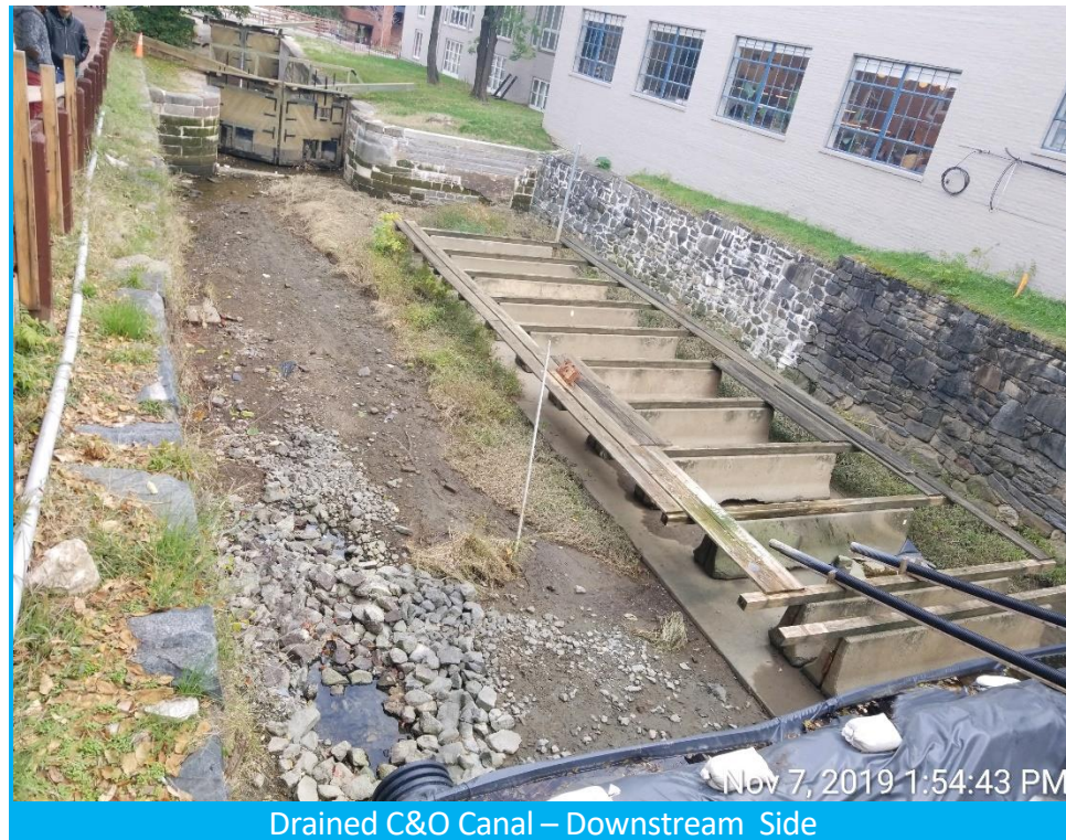
Drained C&O Canal – Downstream Side