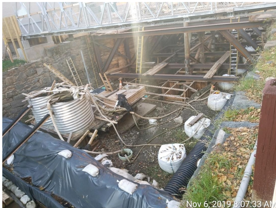
Cleaning and Dewatering of Work Zone