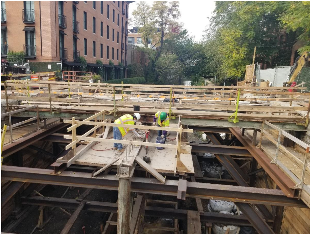
31 st Street Bridge over C&O Canal

Project Website: www.31stStreetBridge.com