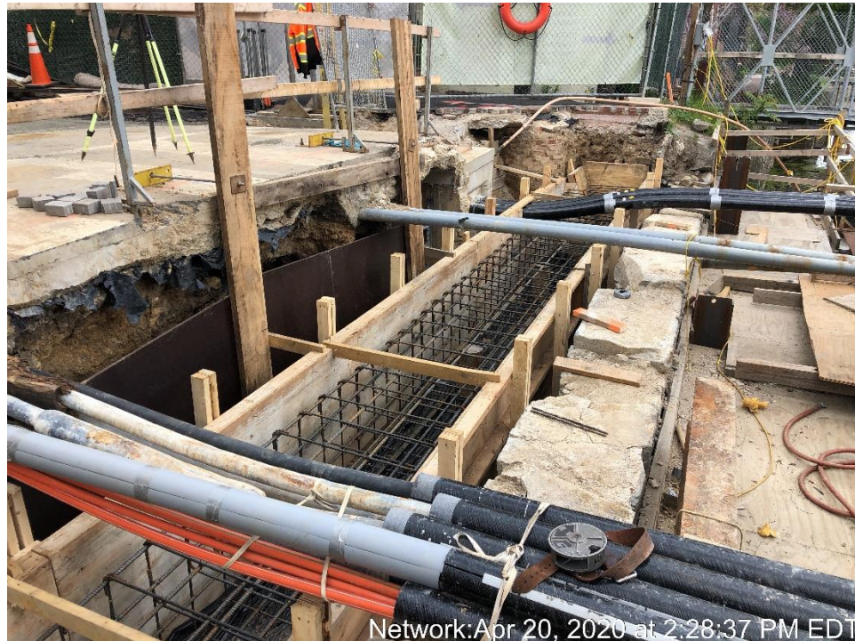
Network: Apr 20, 2020 at 2:28:37 PM EDT Reinforcing Steel at North Abutment Foundation