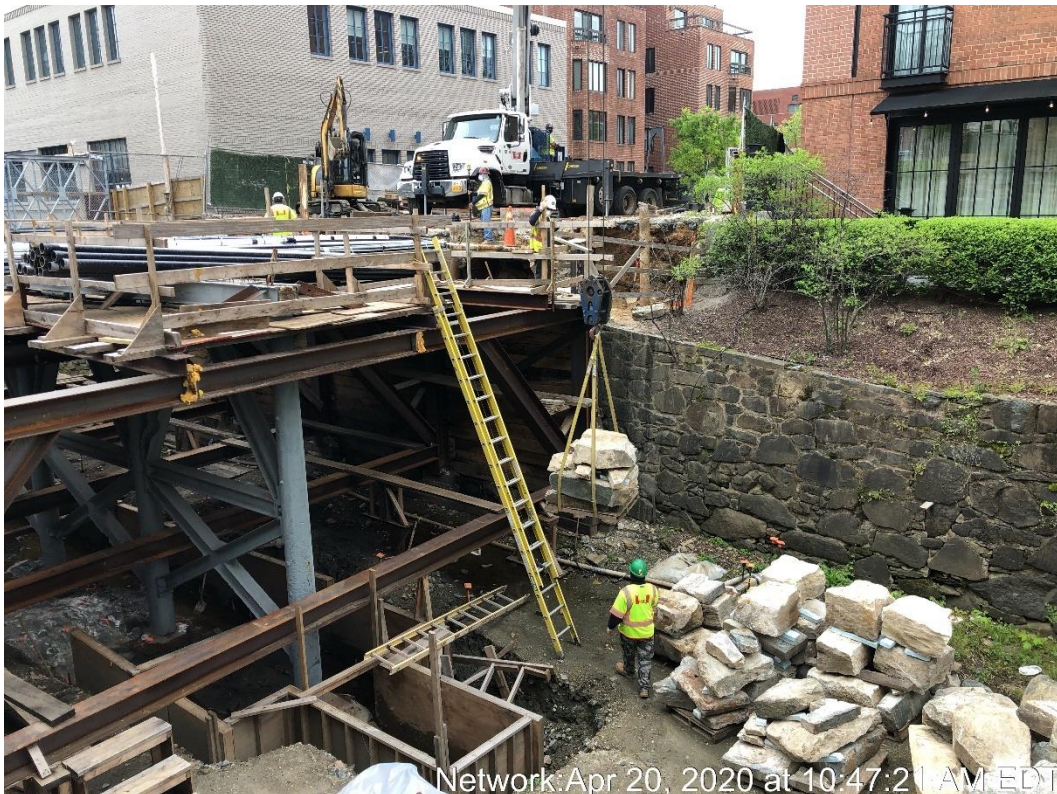
31 st Street Bridge over C&O Canal