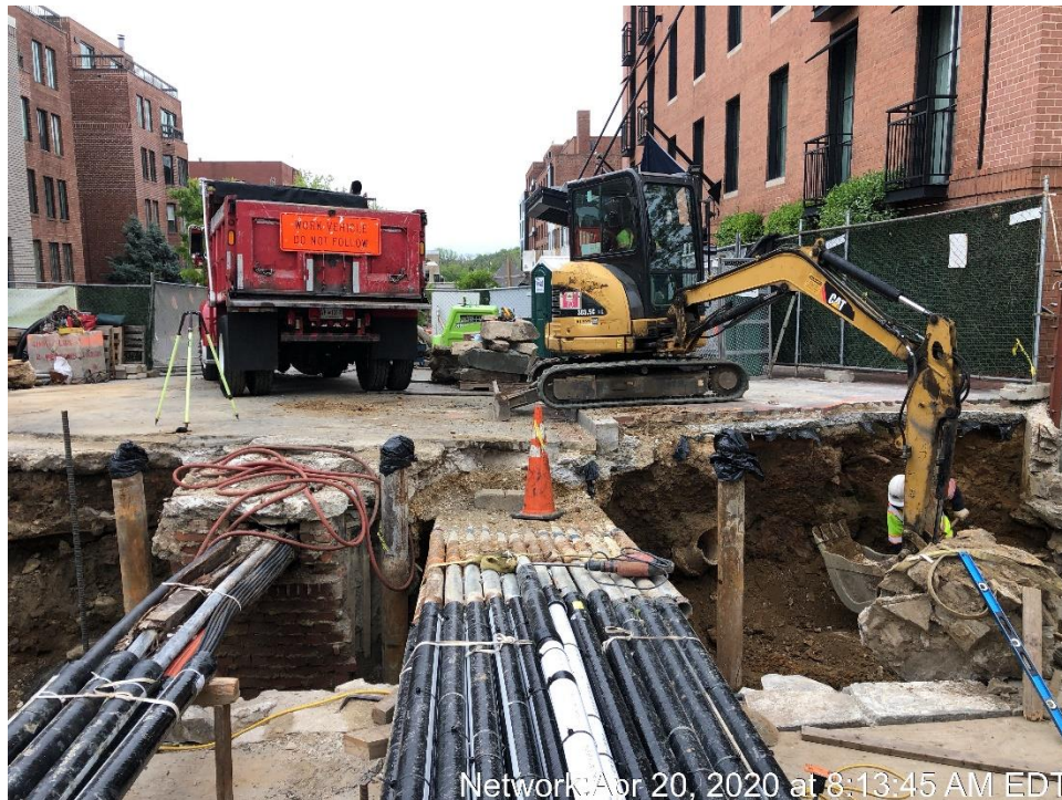
Storing Removed Canal Wall Stones Inside the Canal

Network: Apr 20, 2020 at 12:30:38 PM EDT