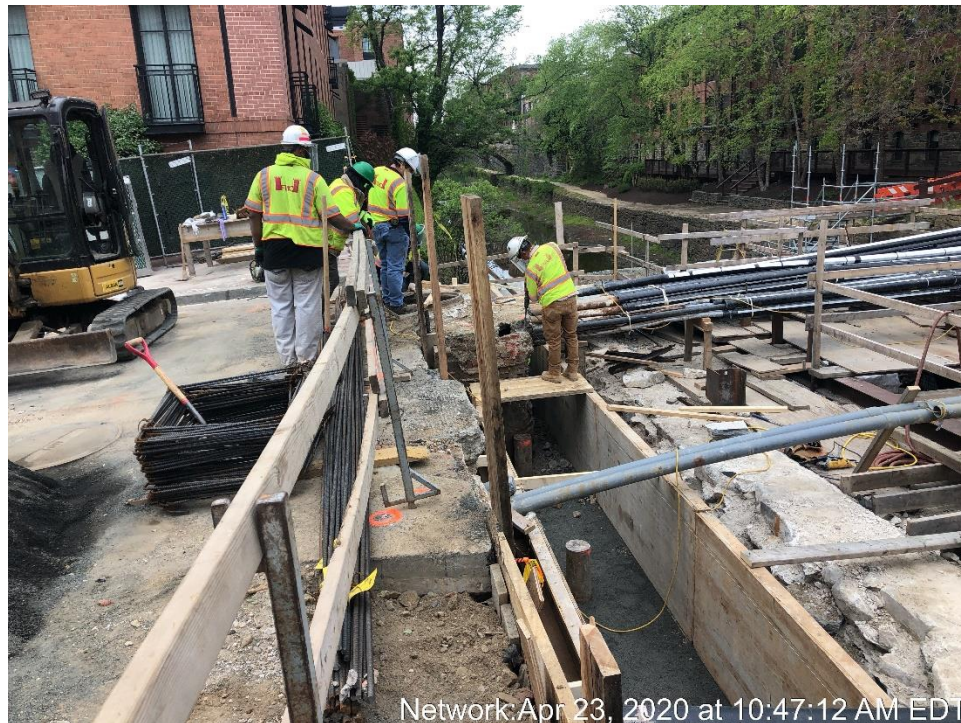
Concrete Curing – North Abutment Foundation

Network: Apr 23, 2020 at 10:47:12 AM EDT