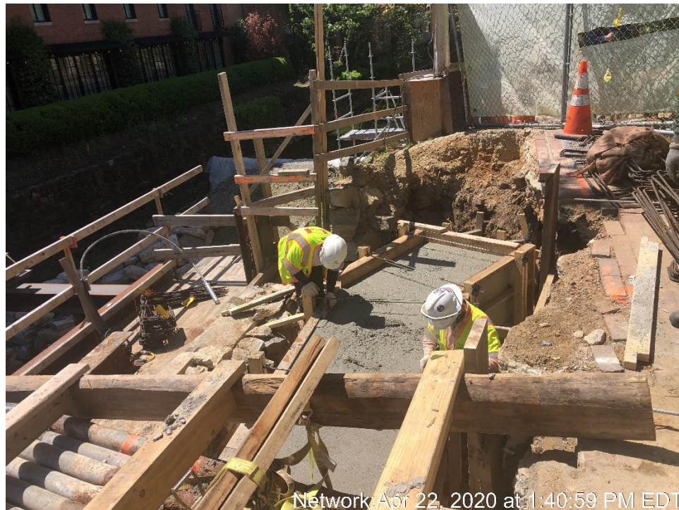
Placement of Concrete at North Abutment Foundation