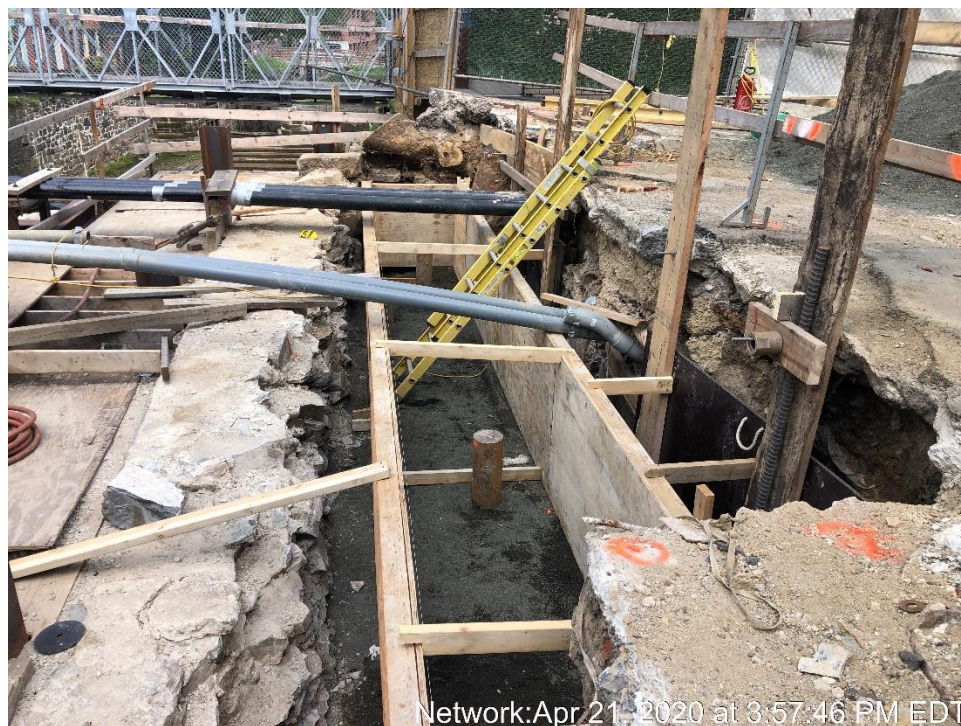
Placement of Reinforcing Steel at North Abutment Foundation