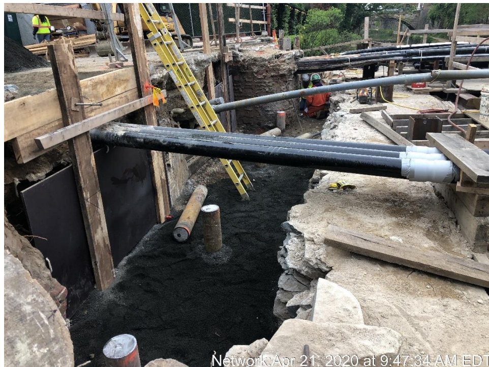
Network: Apr 21, 2020 at 9:47:34 AM EDT Excavation at the South Abutment Foundation